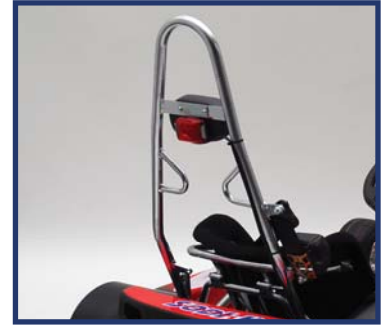
Rollbar - seatbelt

Fully assembled Rear axle cover Engine is solid mounted to the chassis. Front bumper Heavy duty plastic 20mm Rear bumper Heavy duty plastic 20mm Side protection front and rear. Heavy duty, high tensile 30mm solid rear axle Medium size seat plastic Belt drive, with belt tensioner 2:1 gear reduction Honda wet clutch Self adjustable, quick release, hydraulic brakes Fuel tank under the steering column Engine protection cover Adjustable steering column Adjustable pedals Adjustable steering column Heavy duty aluminum rims Adjustable seat (Patent granted.) Heavy duty axle bearings Quiet exhaust, behind seat under rear axle cover Pedals colored green and red Brake disk and sprocket protector plates