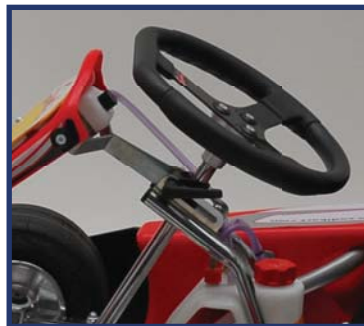
Adjustable steering wheel